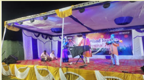
Cultural evening organized at Ferrargunj as part of Island Tourism Festival