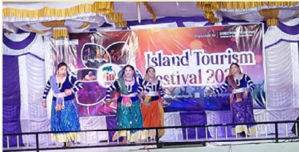
Beautiful dance performance by artistes enthrall gathering at Wimberlygunj as part of ITF-2023