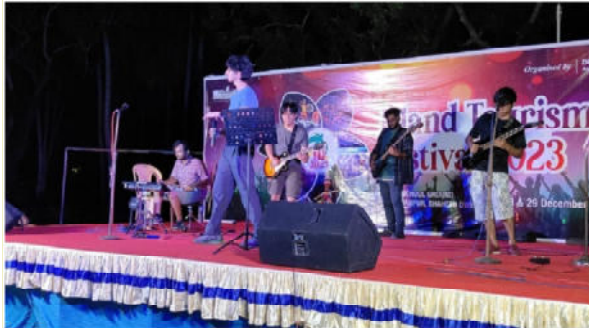
End of Scene Band enthraling the gathering at Shaheed Dweep as part of Island Tourism Festival

As part of Island Tourism Festival, various programmes were held at different venues of A&N Islands. The programmes were held at Shaheed Dweep, Rangat, Mayabunder, Wimberlygunj, Ferrargunj and Wandoor today. Tomorrow (Dec. 29), various programme will be held at Diglipur and other places.