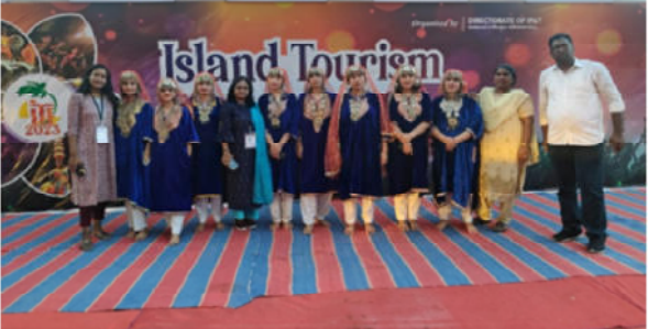
Artistes delighting the gathering at a cultural programme organized at Wandoor as part of ITF-2023.