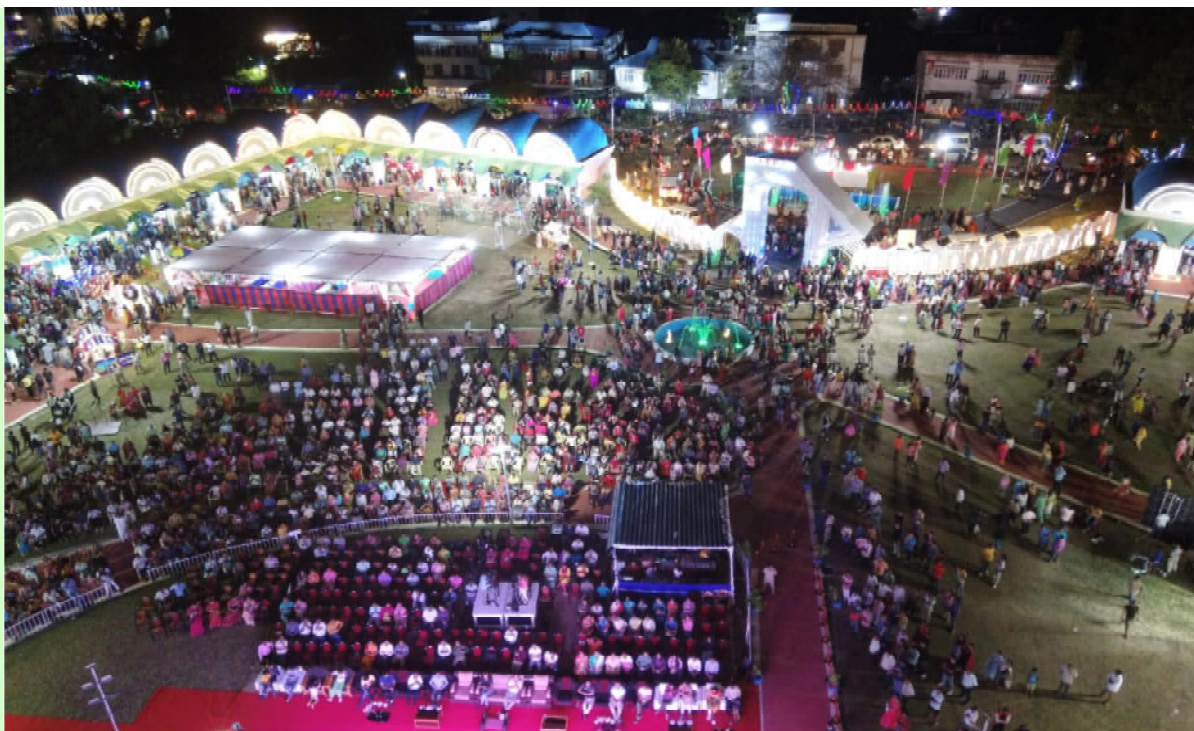
Aerial view of the Island Tourism Festival being held at ITF Ground