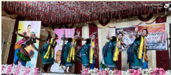
Dance & music by artistes mesmerizes gathering at Mayabunder as part of ITF